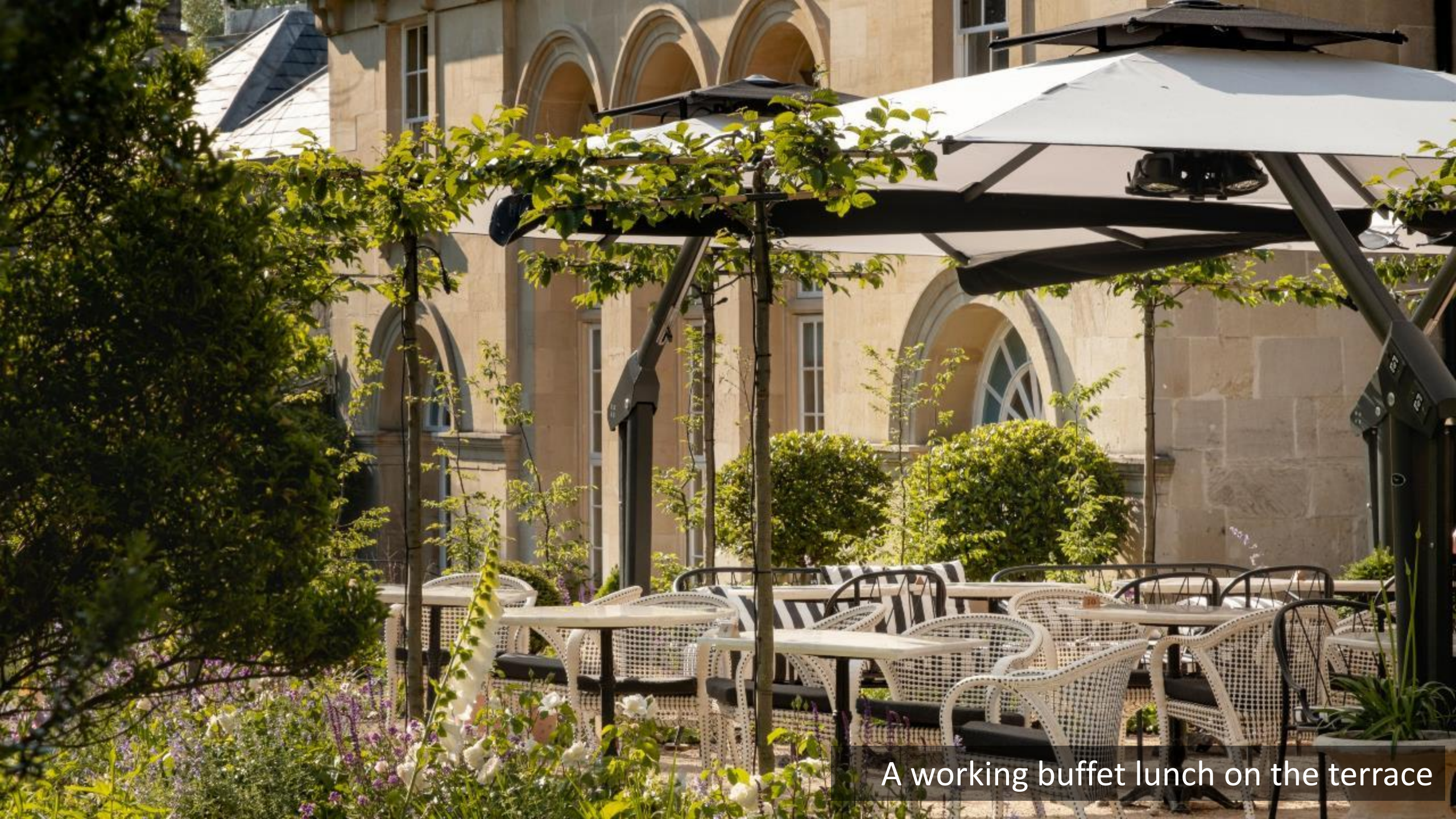
A working buffet lunch on the terrace