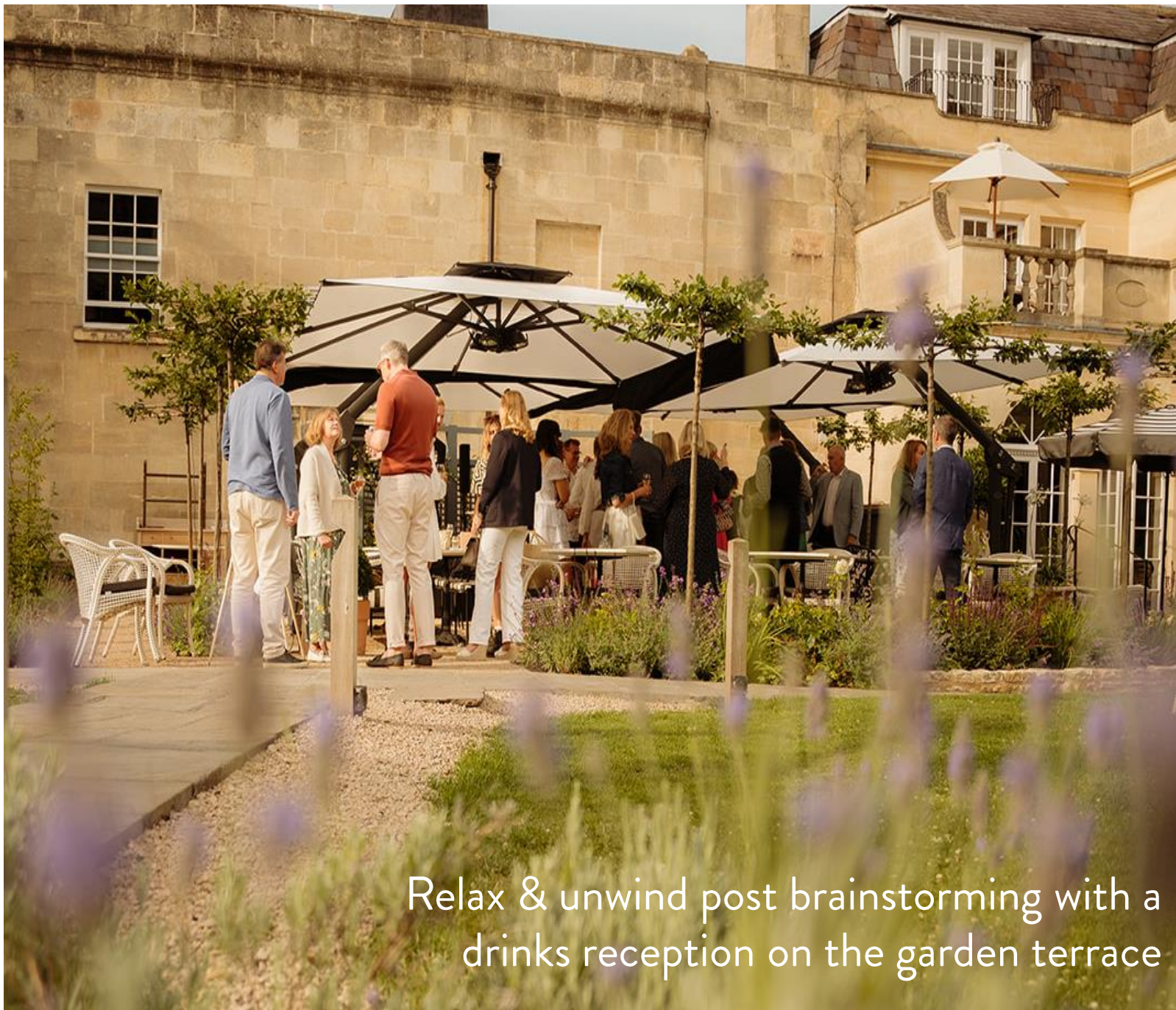
Relax & unwind post brainstorming with a drinks reception on the garden terrace