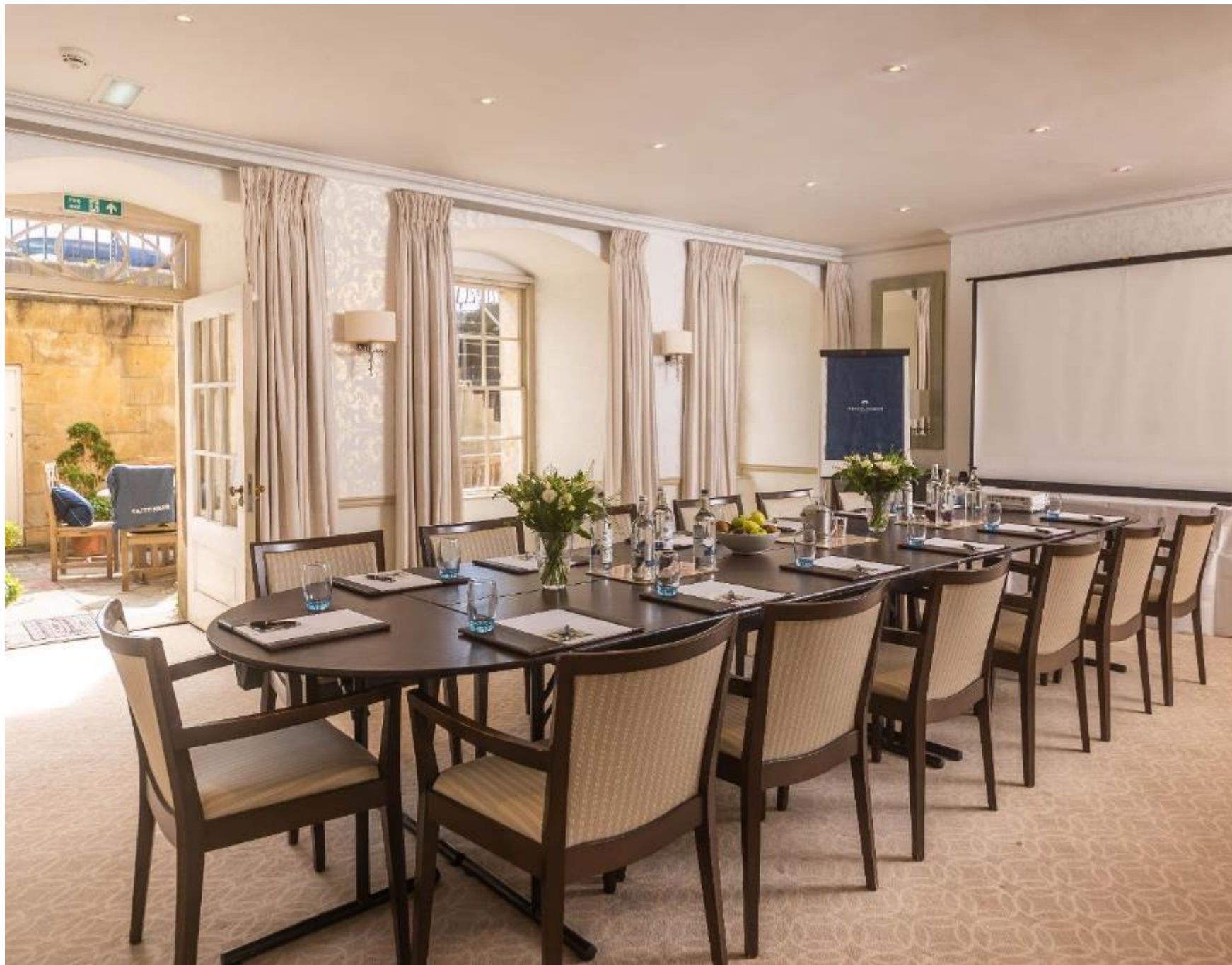
Meeting Space – The Sheridan Room with its own private courtyard