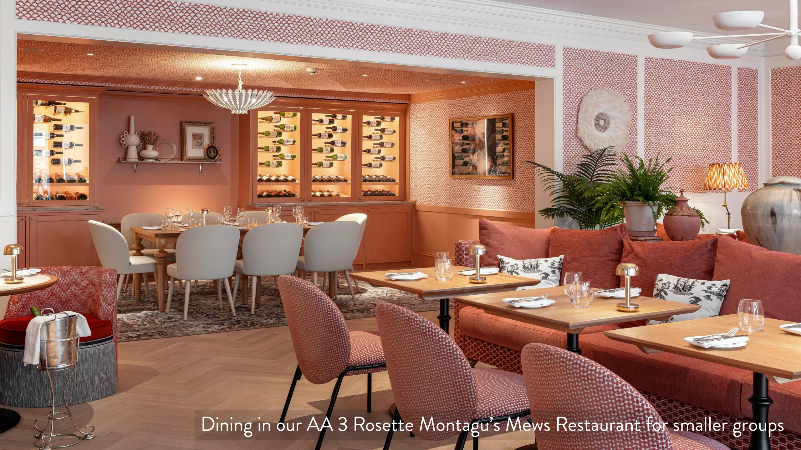
Dining in our AA 3 Rosette Montagu's Mews Restaurant for smaller groups