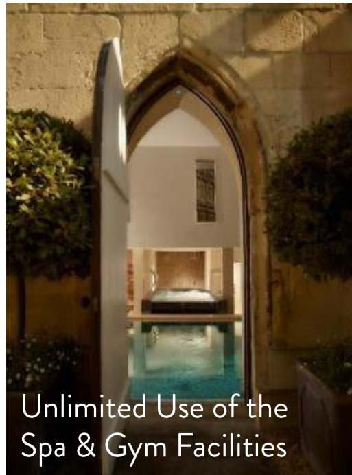
Unlimited Use of the Spa & Gym Facilities