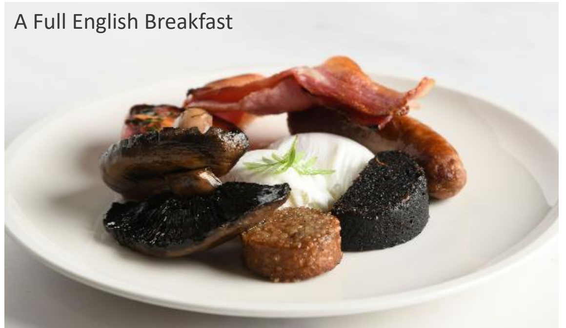
A Full English Breakfast