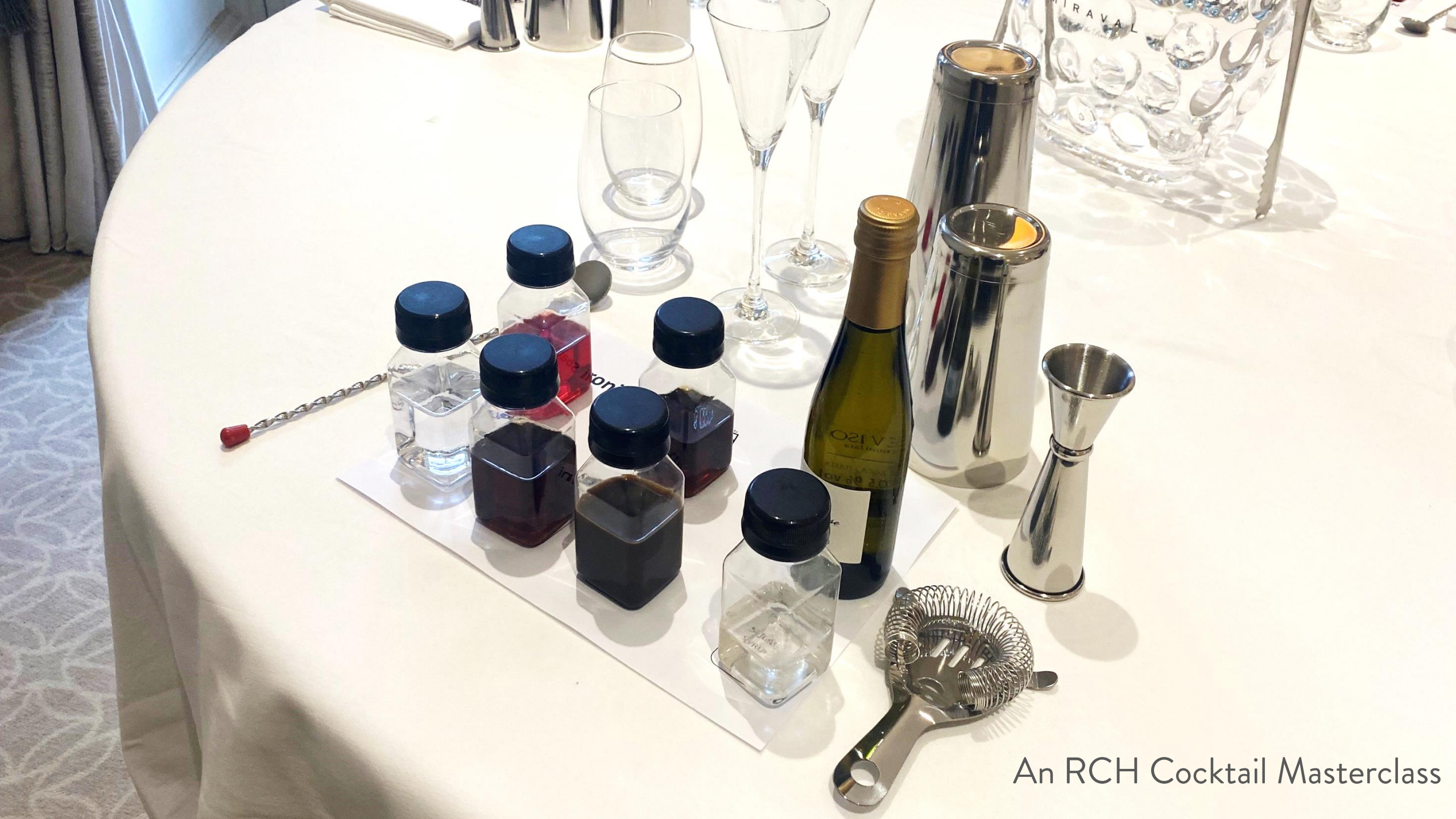
An RCH Cocktail Masterclass